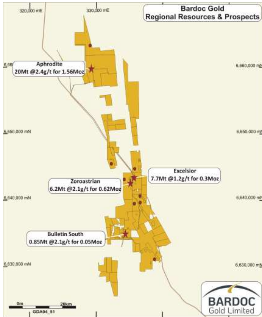
Figure 3: Location Plan